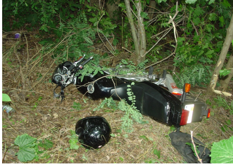
2600 Blk. Elmridge Ave.

Although we have continued to focus on traffic enforcement, this year, we noted a dramatic increase in crashes specifically on Lake Michigan Drive. The intersection of Lake Michigan Dr. and Wilson Ave. is the highest crash location in the city at 47 crashes this year, and the eighth highest crash location in Kent County. Alpine Ave continues to see the majority of the crashes with over 25 percent of all crashes occurring here.