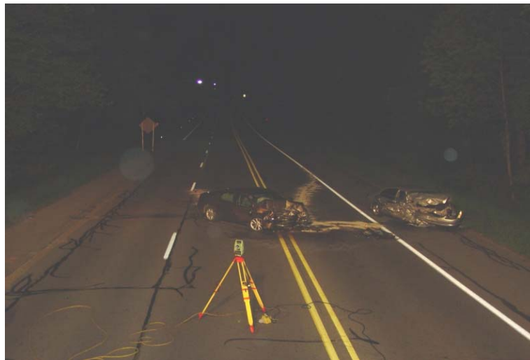
2200 Blk. Wilson Ave